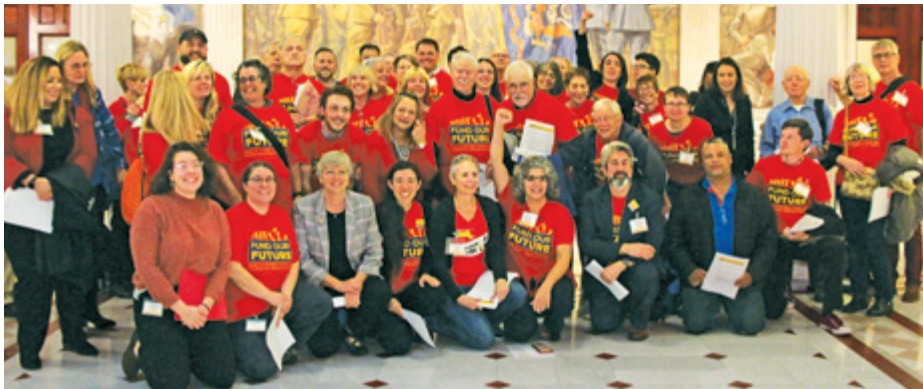
Public education activists from across the Commonwealth gathered at the State House before the October House vote on the Student Opportunity Act , a historic education funding bill.

Victory for more equitable school funding is at hand. The Student Opportunity Act , a major state education funding bill backed by the MTA, has been approved by the Legislature and is widely expected to become law before next year's state budget is finalized.